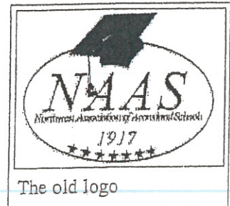
The old logo

Website [1] ( http://www.northwestaccreditation.org/ )